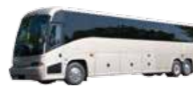
KingLong Coach Bus

Pax x 20, Lug x 10. China Mainland – Hong Kong