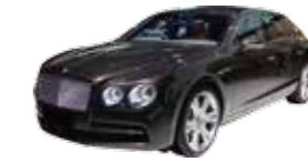
Bentley Flying Spur