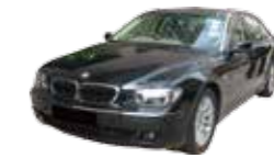
BMW 7 Series