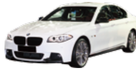
BMW 5 Series