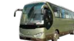
Mercedes Coach Bus