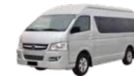
Toyota Hiace Van